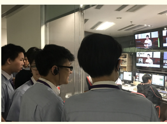
Student learning about the operations of the LegCo meeting